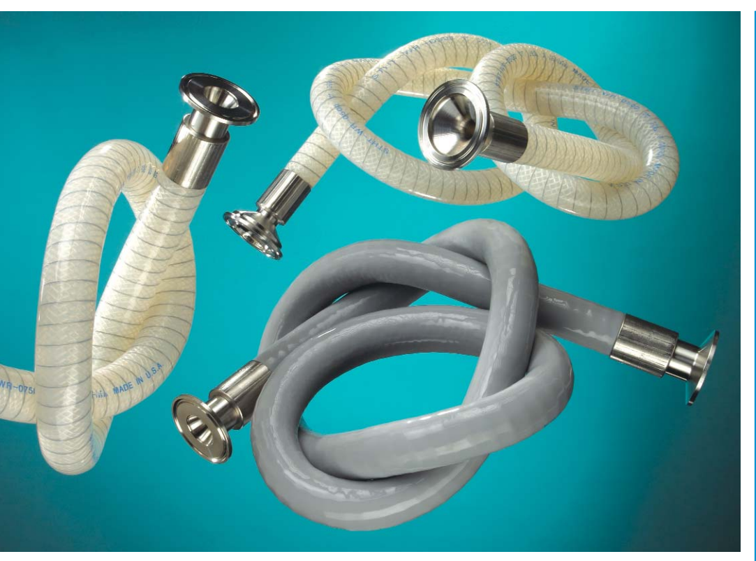
Sani-Tech® STHT®-WR is an ultra-flexible, high-pressure, platinum-cured silicone hose.