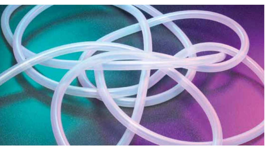
The excellent fatigue resistance properties of TYGON® 3355-L tubing make it an ideal tubing selection for peristaltic pump systems.